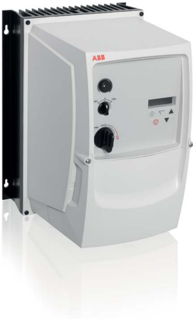
ABB micro drive ACS250 with IP66/NEMA 4X enclosure is designed for applications such as; screws, mixers, pumps, fans and conveyors, which are installed in harsh environments containing dust, moisture and cleaning chemicals. The drive's design and ease of setup benefit a broad range of industries.